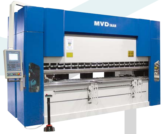
3.6 metre, 160 ton CNC abkant pres CNC HAP 35/160