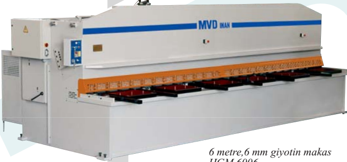
6 metre, 6 mm giyotin makas HGM 6006