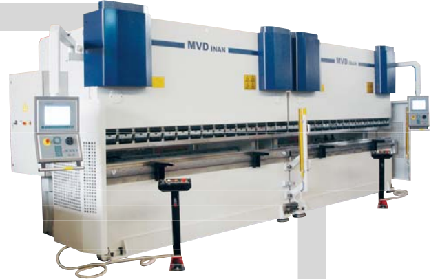
6 metre, 600 ton CNC tandem abkant pres