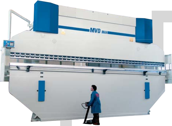
8 metre, 500 ton abkant pres, ağırlık 60 ton HAP 80/500